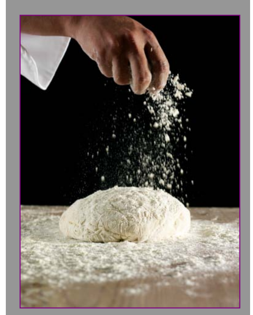
Page 2 :: | What's The Recipe? It's summertime... Sunlight

"Just like baking a cake, your chiropractic health care is a recipe for success, and the amount and frequency of care and the other ingredients that contribute to your health and wellness needs to be administered in just the right way in order to insure success."